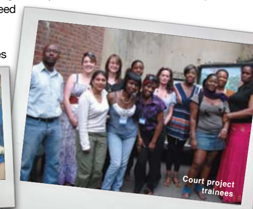
Court project trainees