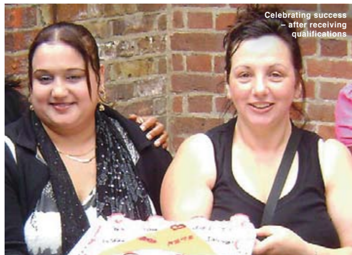
Celebrating success - after receiving qualifications