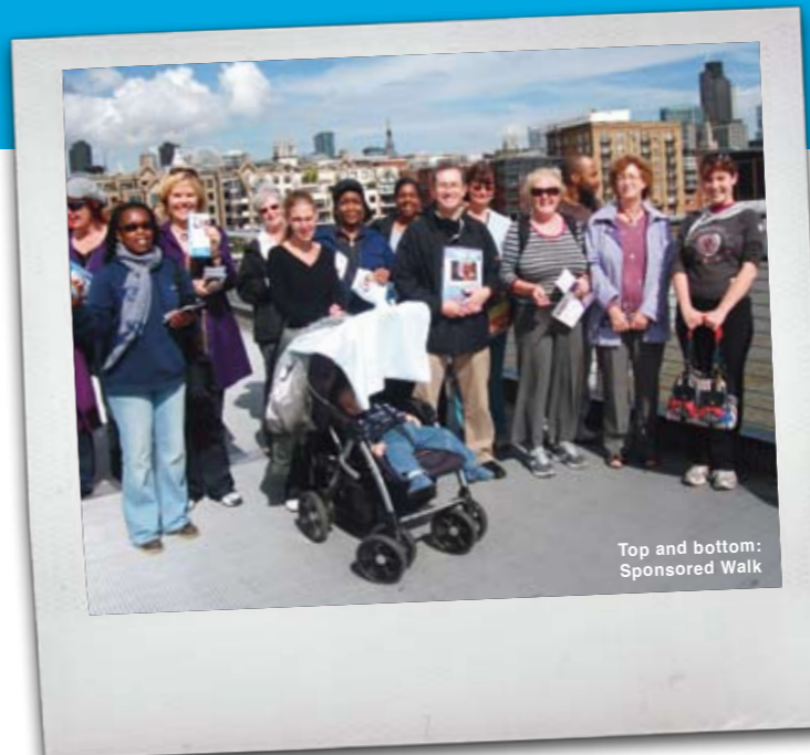
Top and bottom: Sponsored Walk

“ TO ALL THE VERY CARING AND SUPPORTIVE PEOPLE AT THE SWAN CENTRE. THANK YOU VERY MUCH FOR THE TREMENDOUS SUPPORT THROUGH WHAT HAS BEEN A DIFFICULT AND CHALLENGING JOURNEY. IF I HADN'T HAD YOUR SUPPORT, I WOULD HAVE NOT GOT THROUGH ” Swan Centre member